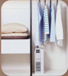
機身小巧 易於收藏 Compact size for easy storage